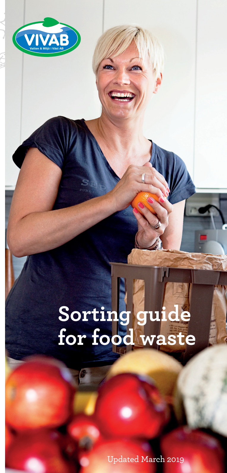
Printed by: Litografiska Media AB, Göteborg 2014. Miljömärkt Tryck sak. 341 834